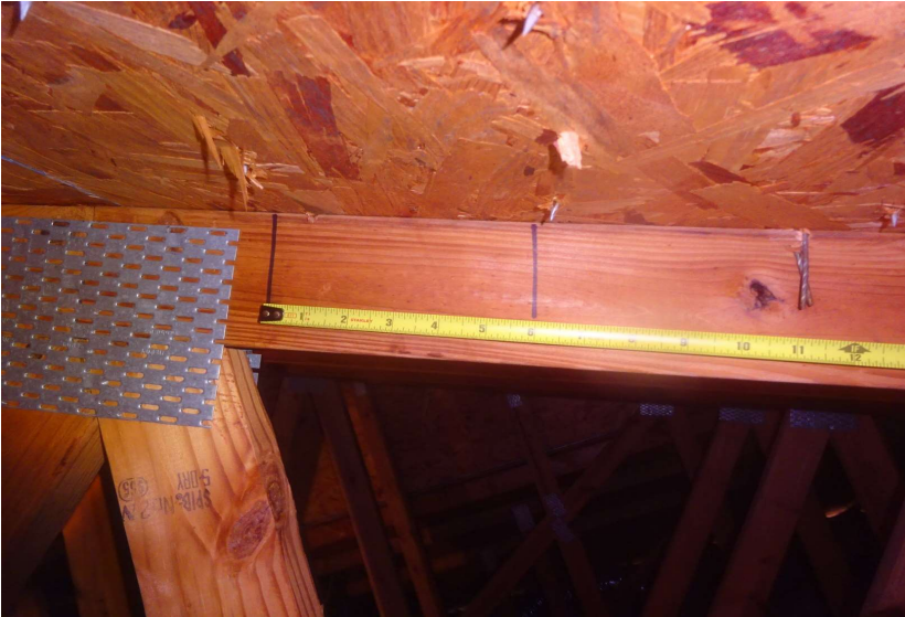
6" spacing in the field