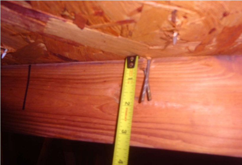
8d nails verified