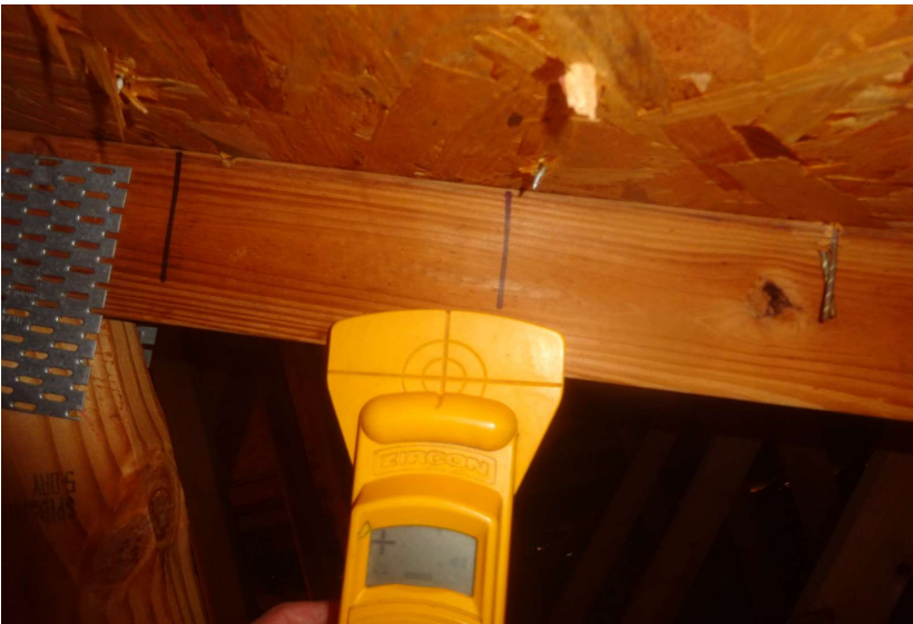
Nail location verified